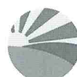
Woodingdean Primary School