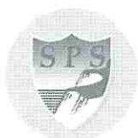
Saltdean Primary School

RETURN TO YOUR SCHOOL OFFICE AS SOON AS POSSIBLE WITH FULL PAYMENT