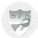
Saltdean Primary School