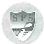
Saltdean Primary School