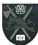
Rudyard Kipling Primary School and Nursery